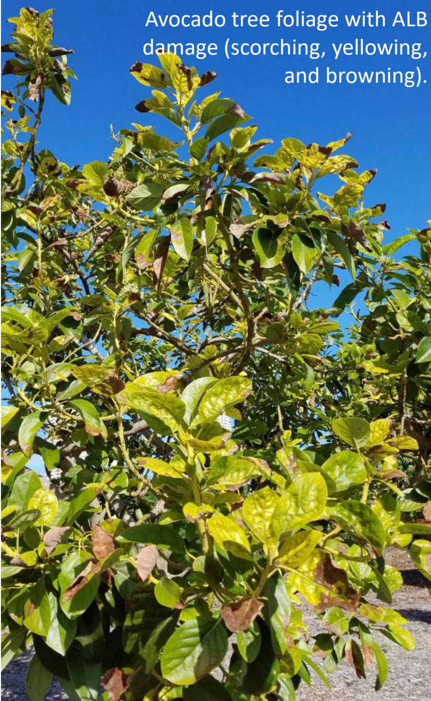
Avocado tree foliage with ALB damage (scorching, yellowing, and browning).