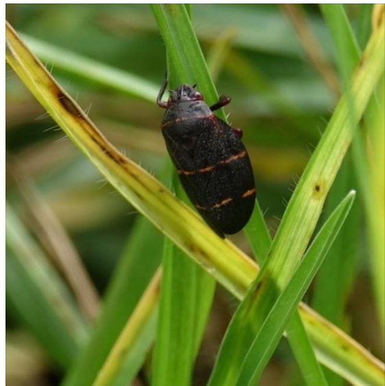
Figure 1. Adult Two-lined spittlebug ( Prosapia bicincta ) on Kikuyugrass.

Two-lined spittlebug (TLSB), Prosapia bicincta , (Hemiptera; Cercopidae) was first detected in Kailua-Kona, on the Big Island of Hawaii in September of 2016 where it had caused severe damage to nearly 2,000 acres of pasture land. The pest has since rapidly expanded its range and is now causing damage to rangelands across an estimated 125,900 acres between Hualalai in the north and Keokea in the south. In highly infested areas, TLSB has resulted in nearly 100% die back of the dominant and key pasture grasses including Kikuyu ( Pennisetum clandestinum ) and pangola ( Digitaria eriantha ) grasses. The loss of these important livestock forages provides entry for the establishment of many undesirable, and often invasive plants such as Pamakani ( Eupatorium adenophorum ), wild blackberry ( Rubus spp.), fireweed ( Senecio madagascariensis ), Hilo grass ( Paspalum conjugatum ), several other minor grasses of low forage quality, and other weeds. Currently TLSB appears to be isolated to the North Kona area, but because of its seeming preference for key livestock forage grasses it has the potential to spread throughout the islands and irreparably harm large areas of valuable livestock grazing lands. Consequently, TLSB is poised to become a major economic threat to the pasture-based livestock industry in Hawaii unless steps are taken to control the pest.