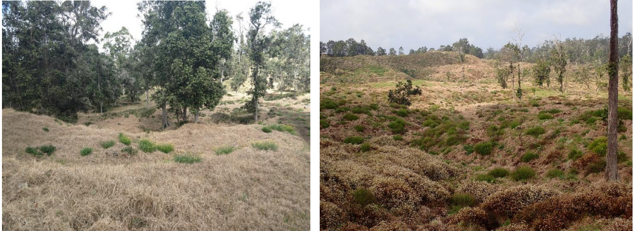
Figure 3. Rangeland damaged by Two-Line Spittlebug in the mauka lands of Kailua-Kona. Two-line Spittlebug densities greater than 50 nymphs/m 2 consistently resulted in the dieback of Kikuyu and Pangola grasses (left) leading to the invasion of weeds such as Pamakani, fireweed, blackberry and many others (right).

The two-lined spittlebug poses a significant threat to the Hawaii Beef Cattle Industry in the state because of its apparent preference for sod-forming grasses like kikuyu and pangola grass that supports nearly 70% of the beef cattle production in the state. To help reduce the potential impact of the pest on the industry: Be alert to the condition of your pastures, be observant to the various insects you observe while in your pastures, and report any sightings of adult two lined spittlebugs, or spittle masses.