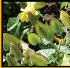
Forest and Kim Starr

Seeds: Papery calyxes which pop open when ripe, ejecting small, round, dark brown seeds