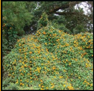
Forest and Kim Starr

Description: Large sprawling or climbing herbaceous vine with smothering habit