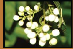
Forest and Kim Starr

Flowers: Tubular, creamy, greenish, in clusters. Fragrant, night bloomer