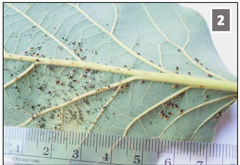
Fig. 2. Underside of avocado leaf showing colony of feeding adult and immature lace bugs alongside excrement, eggs, and nymphal cast skins.

Colonies can be found alongside excrement, eggs, and nymphal cast skins. Adults (Figs. 1, 2) are about 2 mm ( \sim 1/16 inch) in length, oval shaped, have mostly black bodies with a thick black horizontal stripe across their wings, and have yellow legs and yellow antennae with black tips. Immature lace bugs are smaller in size and range in color from dark red to black. Eggs are covered with black excrement and blend with black fecal specks (Fig. 3).