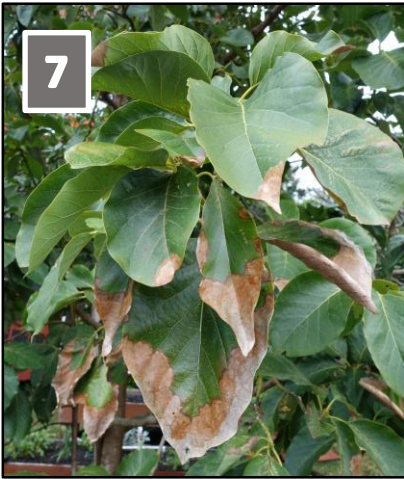
Fig. 7. NOT avocado lace bug feeding damage. Marginal leaf scorching mostly on older leaves.