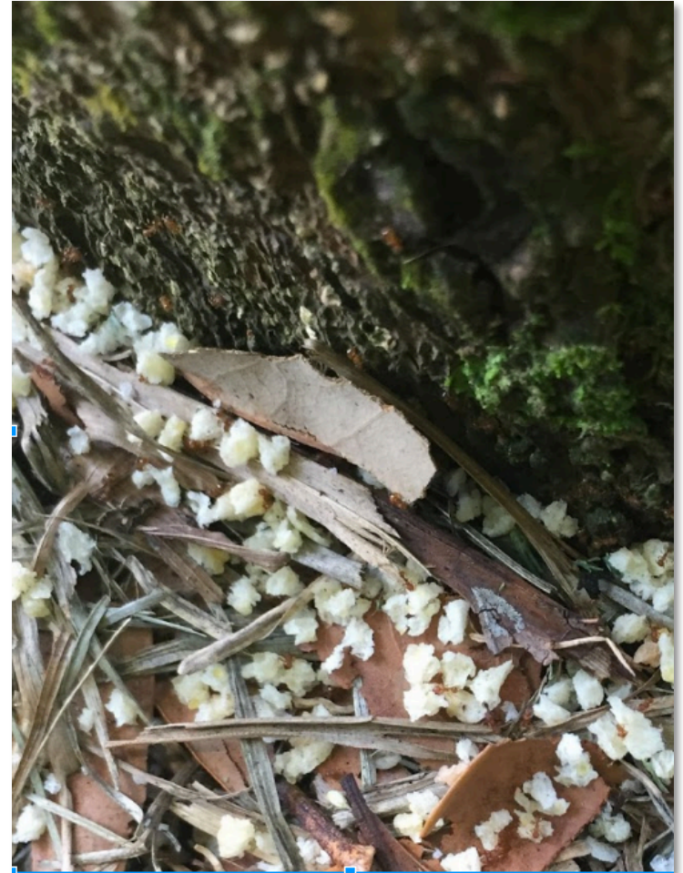
Little fire ants on Siesta granules.

TREATMENT: Whatever product you choose, treat strictly within a 4-6 week window!